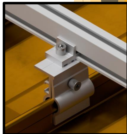
Integration with Railed system connection